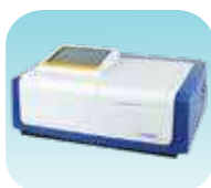
UV/VIS Spectro 2080+ Double Beam

Analytical Technologies is synonymous for offering technologies for doing analysis and is the Fastest Growing Global Brand having presence in at least 96 countries across the global. Analytical Technologies Limited is an ISO:9001 Certified Company engaged in Designing, Manufacturing, Marketing & providing Services for the Analytical, Chromatography, Spectroscopy, Bio Technology, Bio Medical, Clinical Diagnostics, Material Science & General Laboratory Instrumentation. Analytical Technologies, India has across the Country operations with at least 4 Regional Offices, 6 Branch Offices & Service Centers. Distributors & Channel partners worldwide.